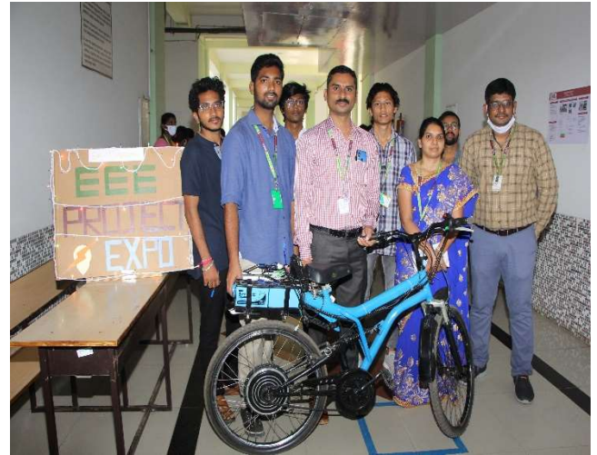
Students participation in Technical events 19.03.2021