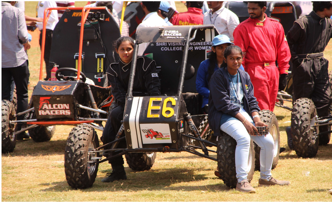
Students participating in Technical events on 19.03.2021