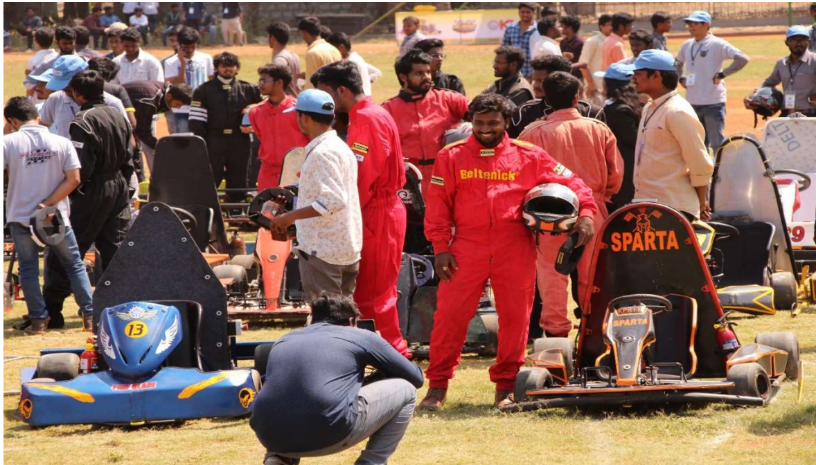
Students participating in Technical events on 19.03.2021